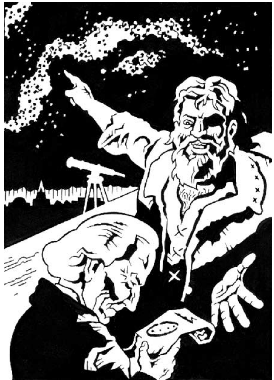
"With this spyglass," Galileo said proudly, "I can bring objects sixty times closer. The principle is complex and difficult to explain, and I laboured mightily to produce it. The Doge will pay heavily to obtain it."

Galileo and the Doctor were standing beside a shrouded shape. Galileo pulled the covering sheet off with a flourish. Steven couldn't see what the fuss was about: all that was underneath was a crude, low power telescope on a tripod. It looked as if it was made out of brass covered in red leather.